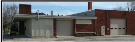
510 Logan Street - Wapakoneta, OH

Call today to tour the property 937-538-1703